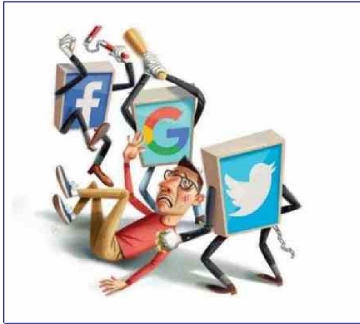
The Silicon Valley Cartel