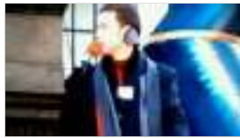
Former 'Idol' Lip Synchs