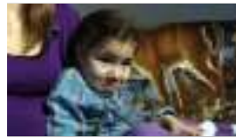
Girl, 4, Held for Shoplifting