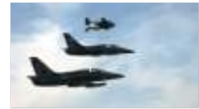
'Jetman' Amazes With New Stunt