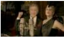
'A Very Lady Gaga Thanksgiving'