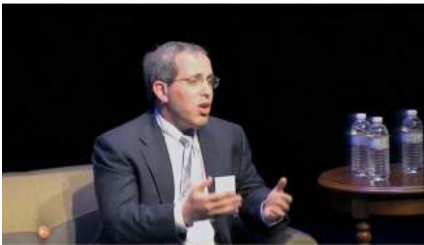
Solyndra Execs Stonewall Congress