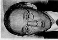
Energy Secretary Steven Chu will be called to testify on Capitol Hill.

The Energy Department softened the terms of the loan and let private investors, who Hearing continues on A10