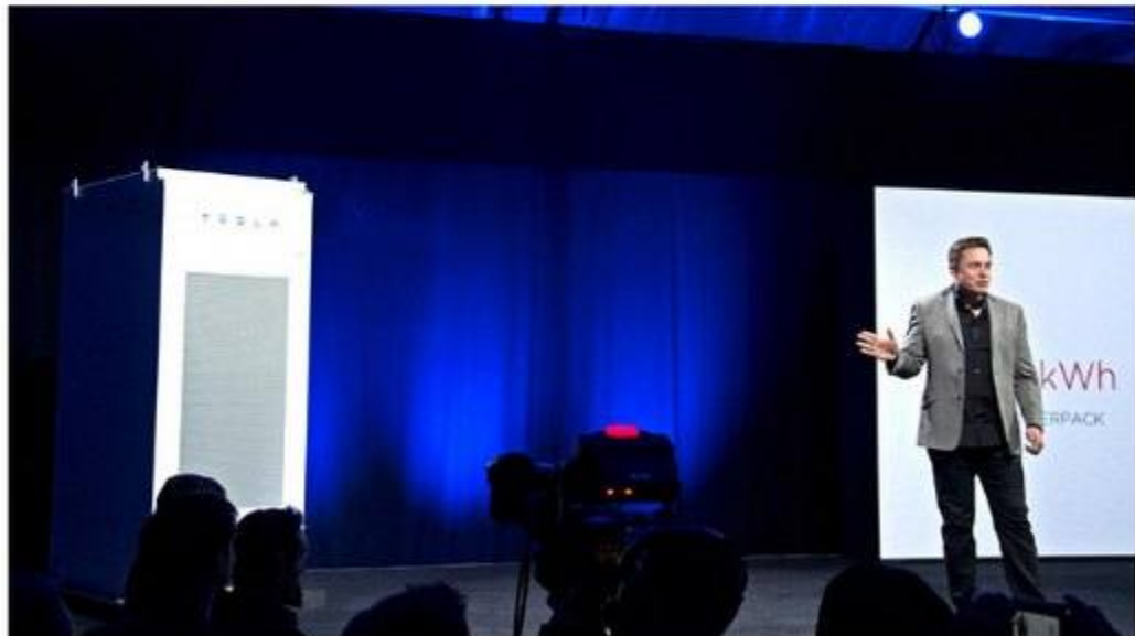
During an event at Tesla's design studio in Hawthorne, Elon Musk introduces a line of batteries for homes and businesses.