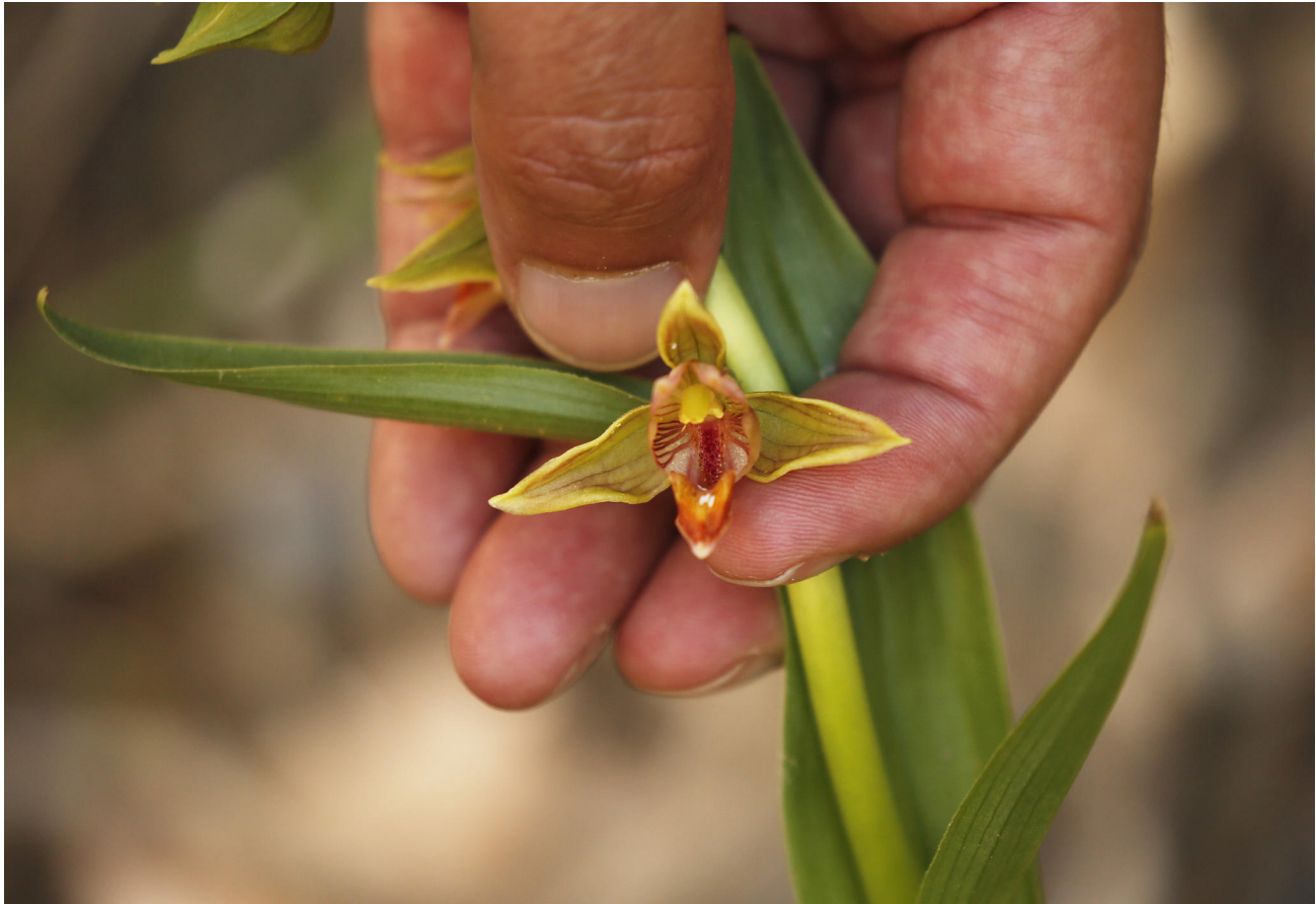
At top, conservation advocates including David Lamfrom, right, hike in Surprise Canyon, home to zebra-tailed lizards and wild orchids.

The Panamint Valley shares many of the geological features seen in profitable lithium-brine deposits in Chile, Argentina, Bolivia and Nevada: arid climate, an active fault, a basin encircled by rock mountains, and underground brine pools heated by geothermal activity.