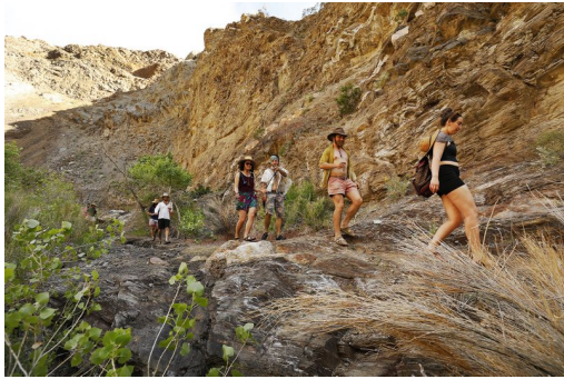
A group celebrating the ninth annual Wilderness Torah, Judaism's spiritual connection with nature, hikes in the Surprise Canyon Wilderness Area.

The Inyo County drilling sites are overseen by the U.S. Bureau of Land Management, which, under federal law, is obligated to not only preserve public lands, but make them productive as well. The BLM must set aside some lands for mining and wilderness, for wildlife and off-road vehicle riders alike.