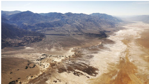
Aerial view looking south of the Panamint Mountains in Panamint Valley.

Recently, the Australia-based firm Battery Mineral Resources Ltd. asked the federal government for permission to drill four exploratory wells to see if the hot, salty brine beneath the valley floor contains economically viable concentrations of lithium. The soft, silvery-white metal is a key component of rechargeable lithium-ion batteries and is crucial to the production of electric and hybrid vehicles.