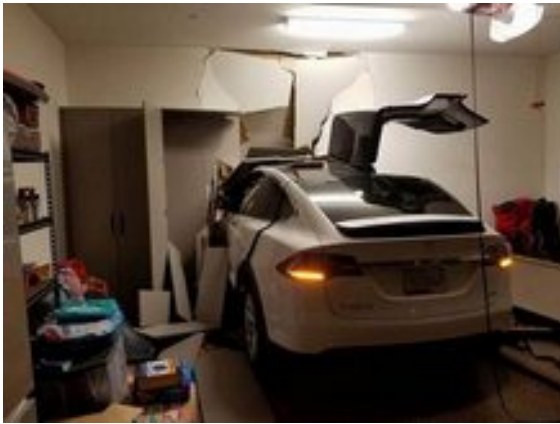
The September crash of a Tesla Model X through the home of South Korean singer and actor Ji Chang Son.