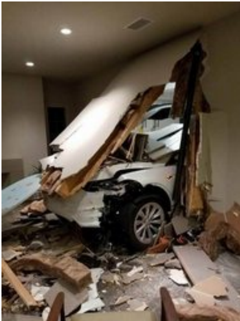
The crash ended with the nose of the vehicle in Ji Chang Son's living room.